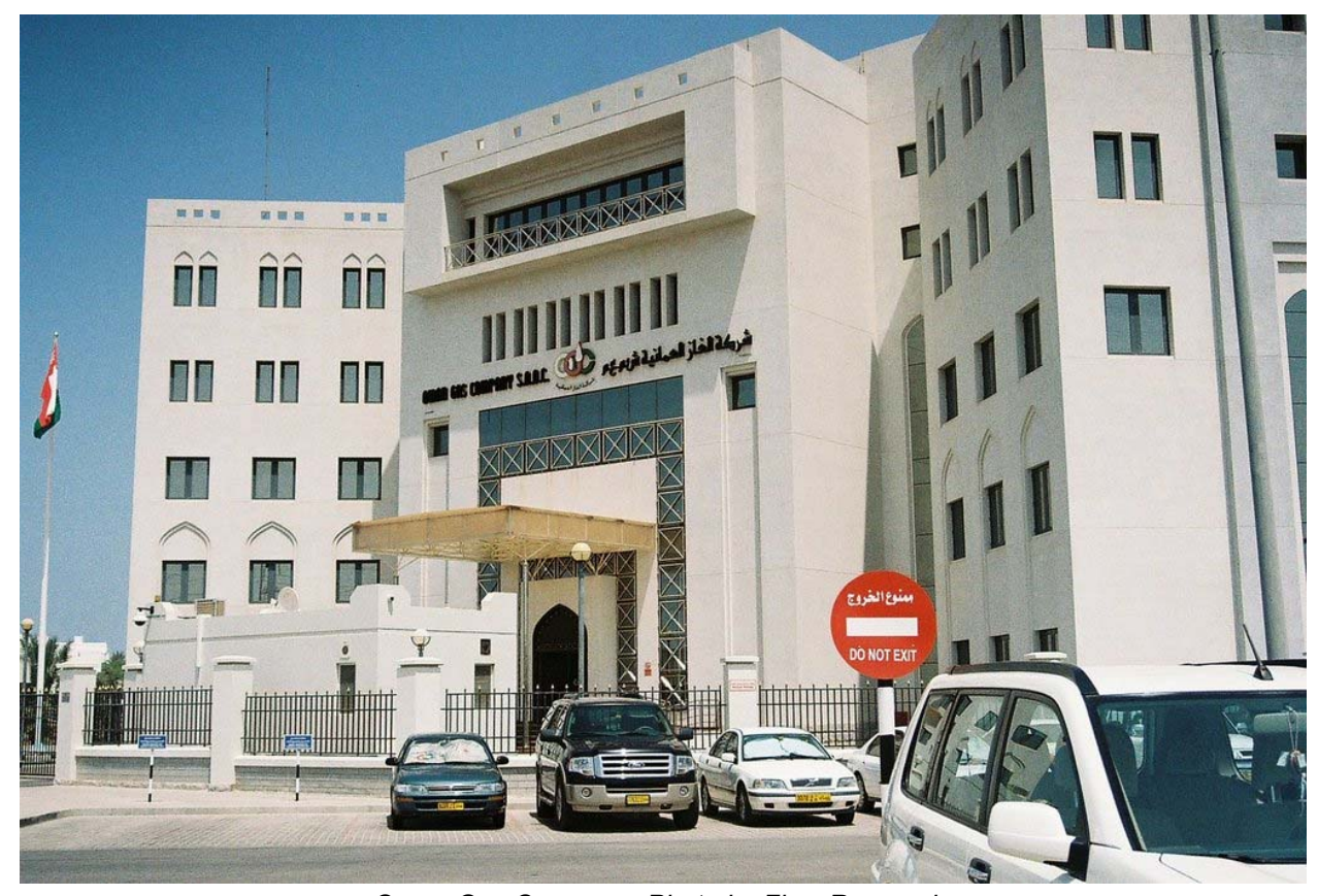
Oman Gas Company